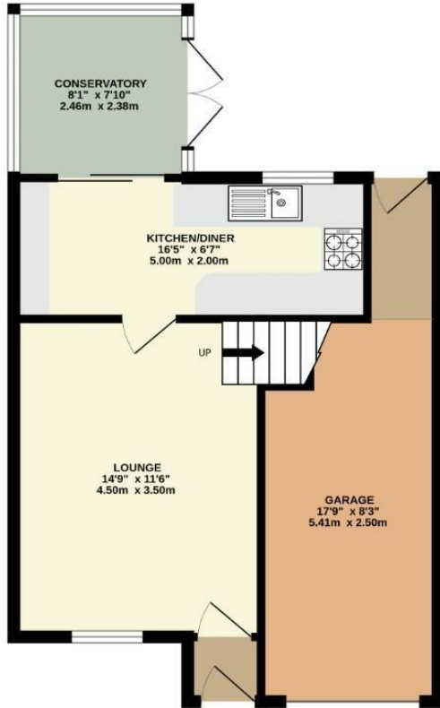
GROUND FLOOR 518 sq.ft. (48.1 sq.m.) approx.